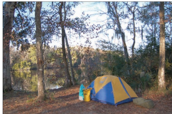
A camp along the Altamaha.

learned that there are dozens of miles of interconnecting channels and did our best to explore them. Many are but twisting, little creeks, while all take you back into a vast cypress-tupelo swamp that, though all logged at one time, still hide some magnificent, old-growth cypress specimens. Though swampy, there are still some chunks of high ground on which to camp. At one such site, we learned the tradition of camping goes back way before the arrival of Europeans, as evidenced by the mounds of oyster shells salted by shards of primitive pottery. If I have sold you on the virtue of such a modest winter escape, I offer one last bit of advice. We have concluded that jumping from the tranquility of such a canoe trip back to the madness of life in DC can result in metal shock and trauma. So to decompress, we like to finish each such excursion with a trip out to nearby Cumberland Island National Seashore. A day of hiking on an empty beach or in the haunted live-oak forests behind the dunes feels very good after a week of sitting and kneeling. I take particular delight in stalking oblivious, foraging armadillos and pulling their tails. And finally, just to break the long slog back home, a few hours early morning stroll around the historic district of Savannah keeps it a vacation almost to the very end. We look forward to reading your trip report in next year's Cruiser .