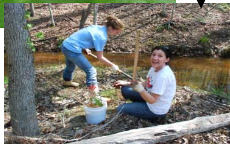
Earth Sangha Volunteers planting along Thompson Creek (VA)