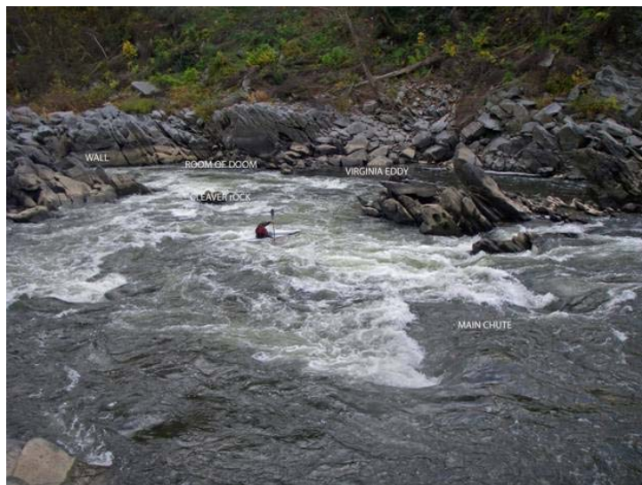
Figure 1. Little Falls at 2.7 feet. Taken Sunday November 8, 2008. The main channel makes an S turn, creating a direct line to the Virginia eddy.

With higher water, the tide is pushed downstream and no longer plays havoc with the features of the rapid. The rapid, although still challenging, is at least predictable.