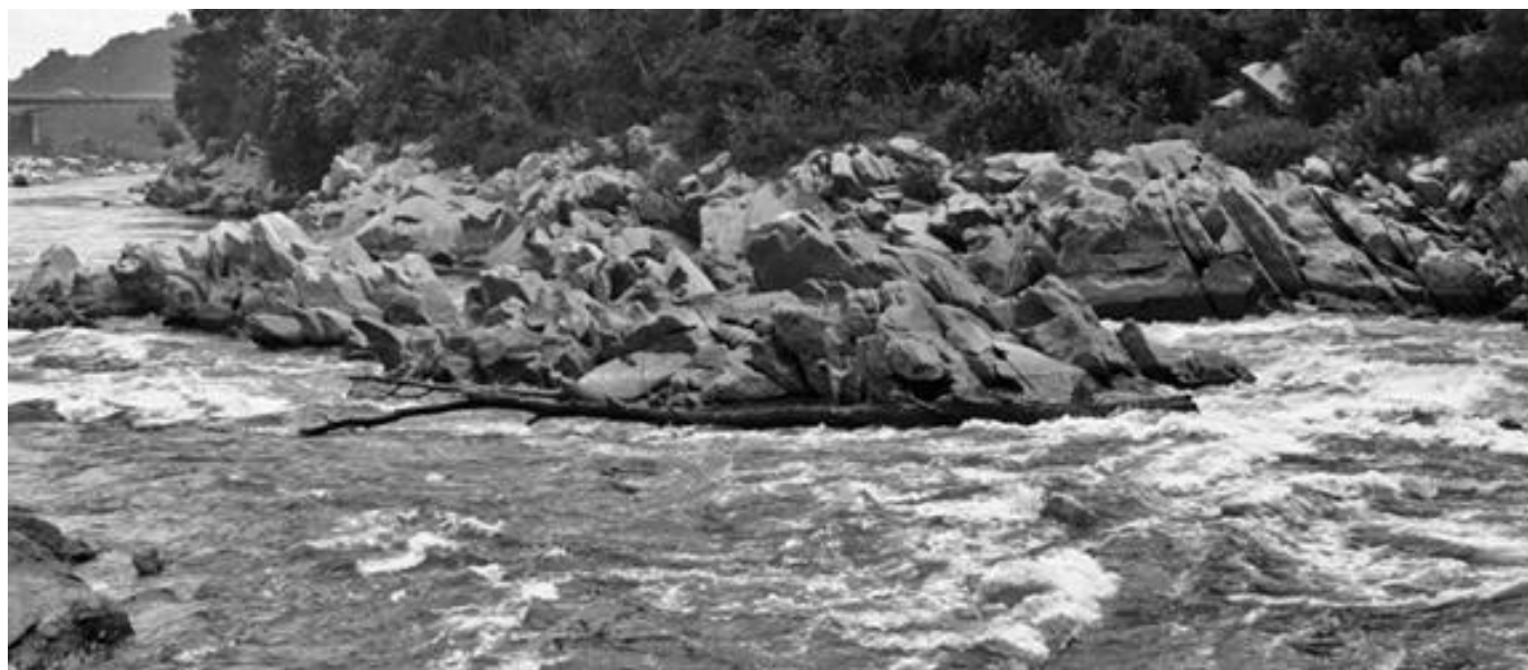
Figure 4: The channel has now moved left forming a pillow at the tip of the Rocky Island, fully capable of pinning boats and other buoyant objects.