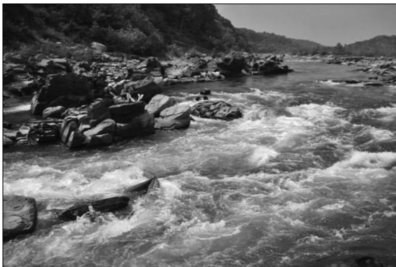
Figure 2 When the channel at Little Falls goes straight into Cleaver Rock, unfortunate and unexpected paddling mishaps can occur.